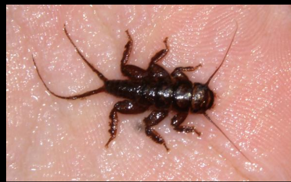
Common Stonefly Family Perlidae