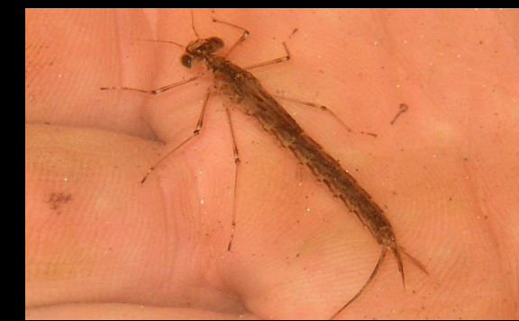
Narrow-winged Damselfly Family Coenagrionidae