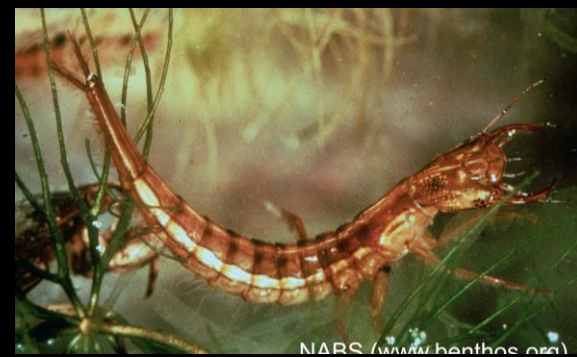
Predaceous Diving Beetle* Family Dytiscidae