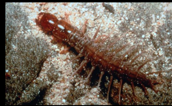
Dobsonfly* Family Corydalidae