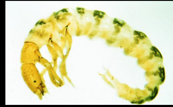
Fingernet Caddisfly* Family Philopotamidae