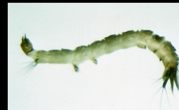
Meniscus Fly* Family Dixidae