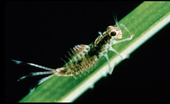
Small Minnow Mayfly* Family Baetidae