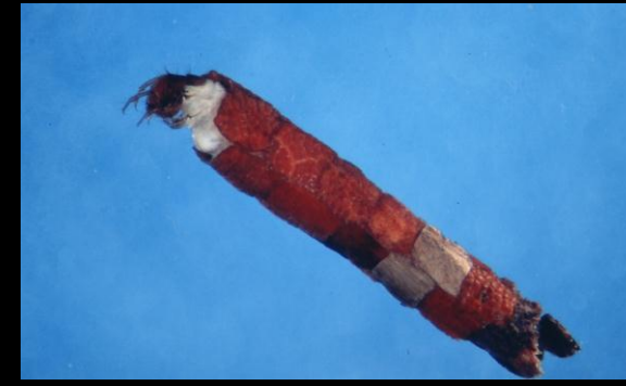
Bizarre Caddisfly* Family Lepidostomatidae