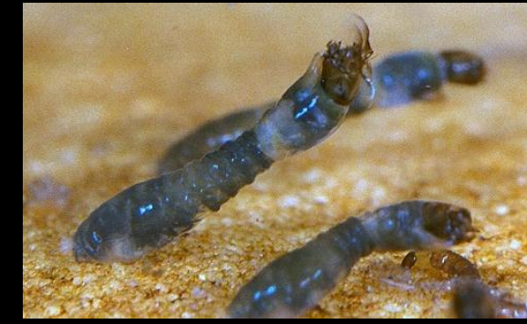
Blackflies* Family Simuliidae