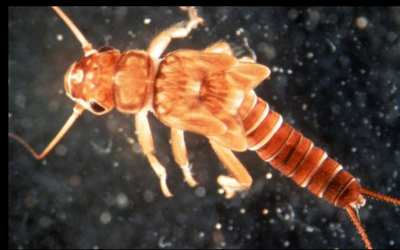
Perlodid Stonefly* Family Perlodidae