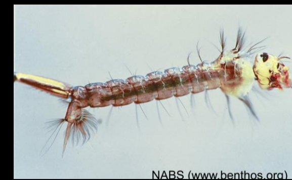
Mosquito* Family Culicidae