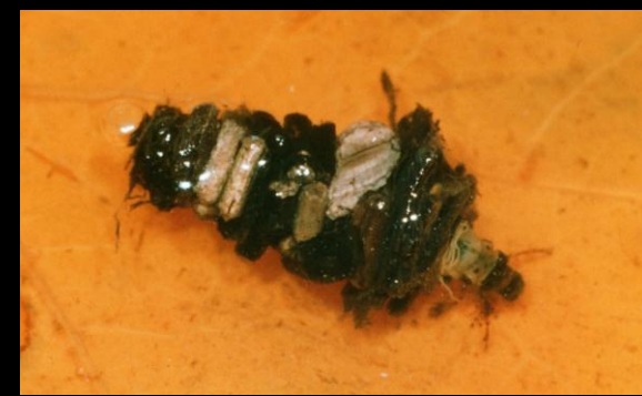
Northern Caddisfly* Family Limnephilidae