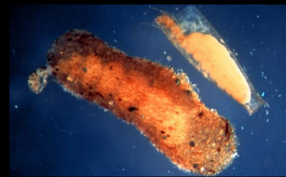
Microcaddisflies* Family Hydroptilidae