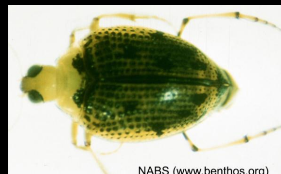
Crawling Water Beetle* Family Haliplidae