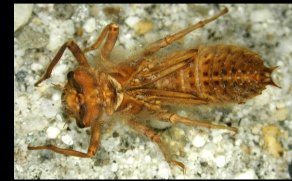
Spiketail Dragonfly* Family Cordulegastridae