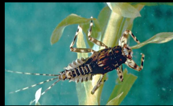
Spiny Crawler Mayfly* Family Ephemerellidae