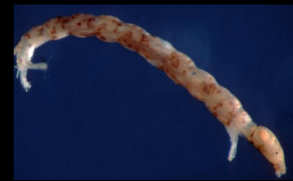
Non-biting Midge* Family Chironomidae