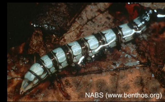
Horse Fly* Family Tabanidae