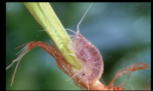
Scud* Family Crangonyctidae