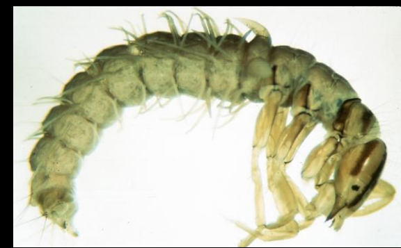
Giant Casemaker Caddisfly* Family Phryganeidae