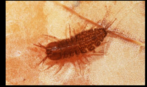
Aquatic Sow Bugs* Family Asellidae