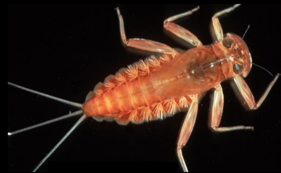
Flathead Mayfly* Family Heptageniidae