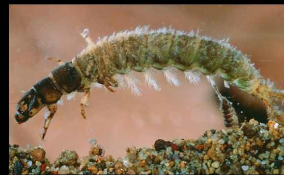
Net-spinning Caddisfly* Family Hydropsychidae