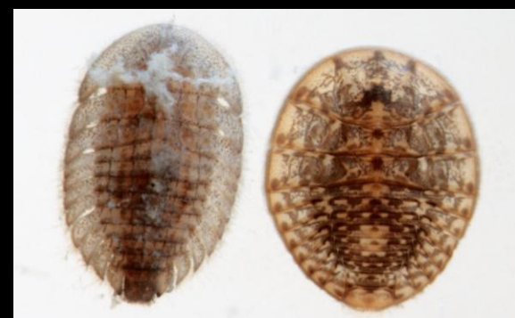
Water Pennies* Family Psephenidae