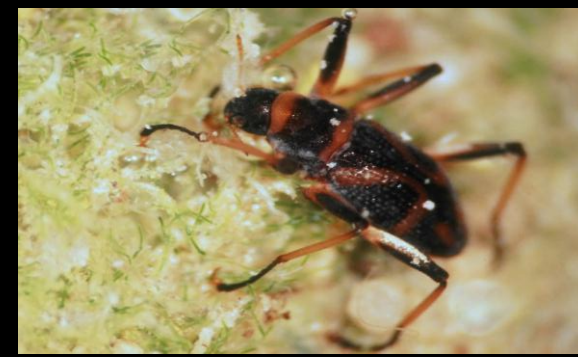
Riffle Beetle* Family Elmidae