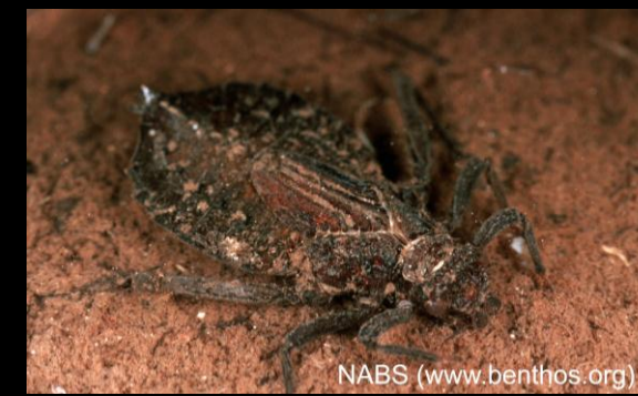
Clubtail Dragonfly* Family Gomphidae