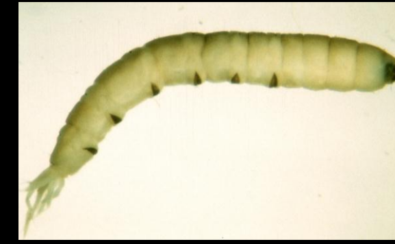
Crane fly* Family Tipulidae