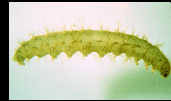
Pyralid Moth* Family Pyralidae

Fairfax County Department of Public Works and Environmental Services Stormwater Planning Division 12000 Government Center Parkway, Suite 449 Fairfax, Virginia 22035-0052 www.fairfaxcounty.gov/dpwes/stormwater 703-324-5500, TTY 711