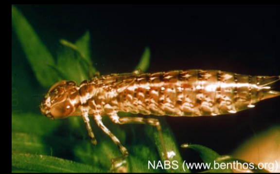
Darter Dragonfly* Family Aeshnidae