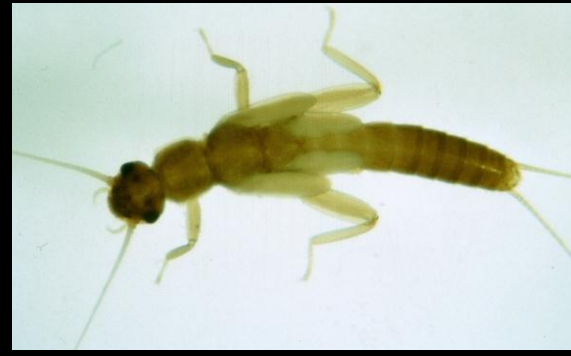
Rolled-Winged Stonefly* Family Leuctridae